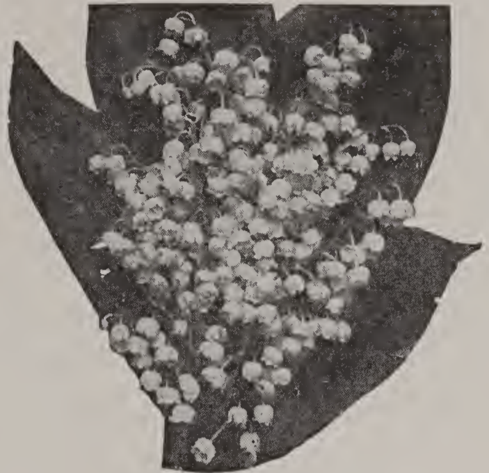
LILY OF THE VALLEY